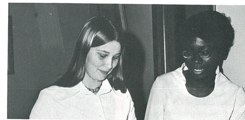
Girls talk over their cooking.